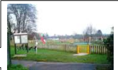
Eversley Recreation Ground