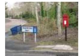
Frampton Way turning