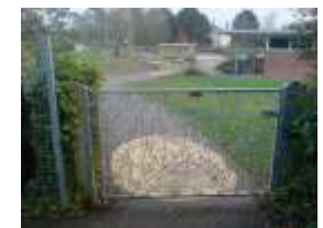
Rear entrance gate to school