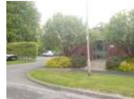
Lionel Tubbs Hall – Park & Stride car park