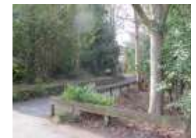
Cut through from Frampton Way to footpath